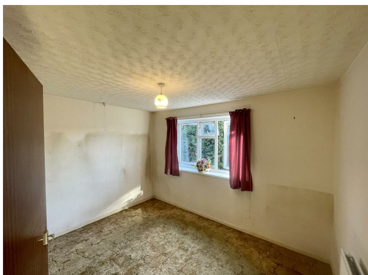
Front window, radiator