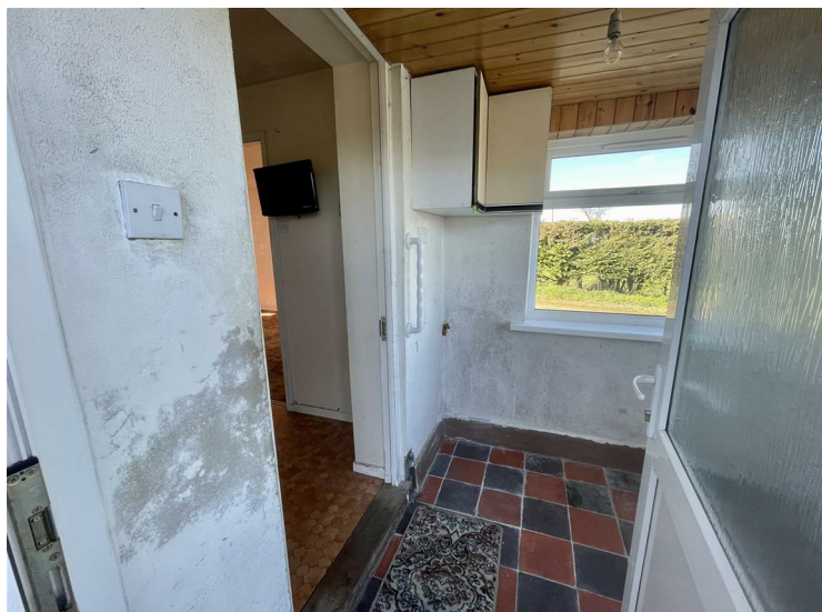
Side entrance door.