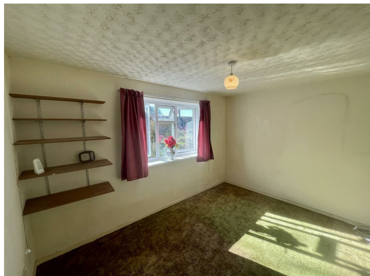
Front window, radiator.