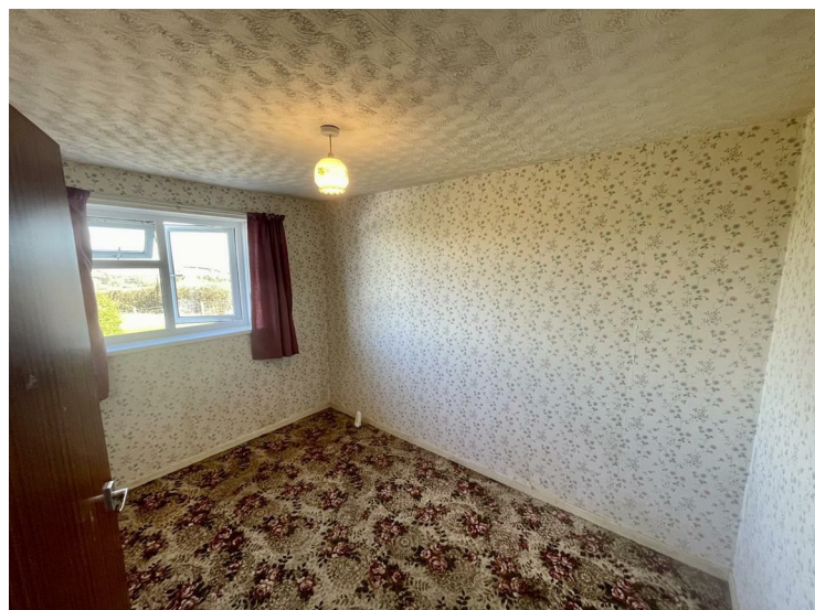
Rear window, radiator