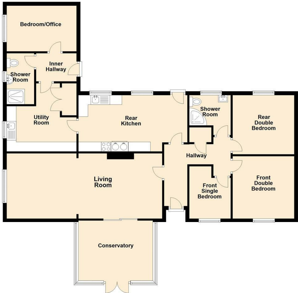
Total area: approx. 126.4 sq. metres (1361.0 sq. feet) For illustration purposes only, floor-plan not to scale and measurements are approximate. Plan produced using PlanUp.