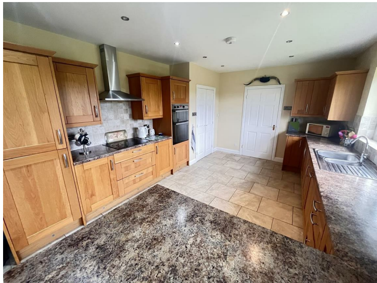
Kitchen - dining room 25'10 x 11'9 (7.87m x 3.58m)

This is an attractive room and is the heart of this lovely home with tiled flooring, extensive range of kitchen units at base and wall level incorporating 1.5 bowl sink unit, double oven, ceramic hob with extractor hood over, integrated dishwasher, spot lighting, airing cupboard housing hot water cylinder.