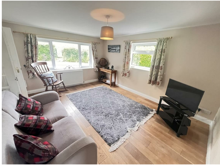
Dining / sitting room 14 x 11'7 (4.27m x 3.53m)

With oak flooring, double aspect windows and radiator.